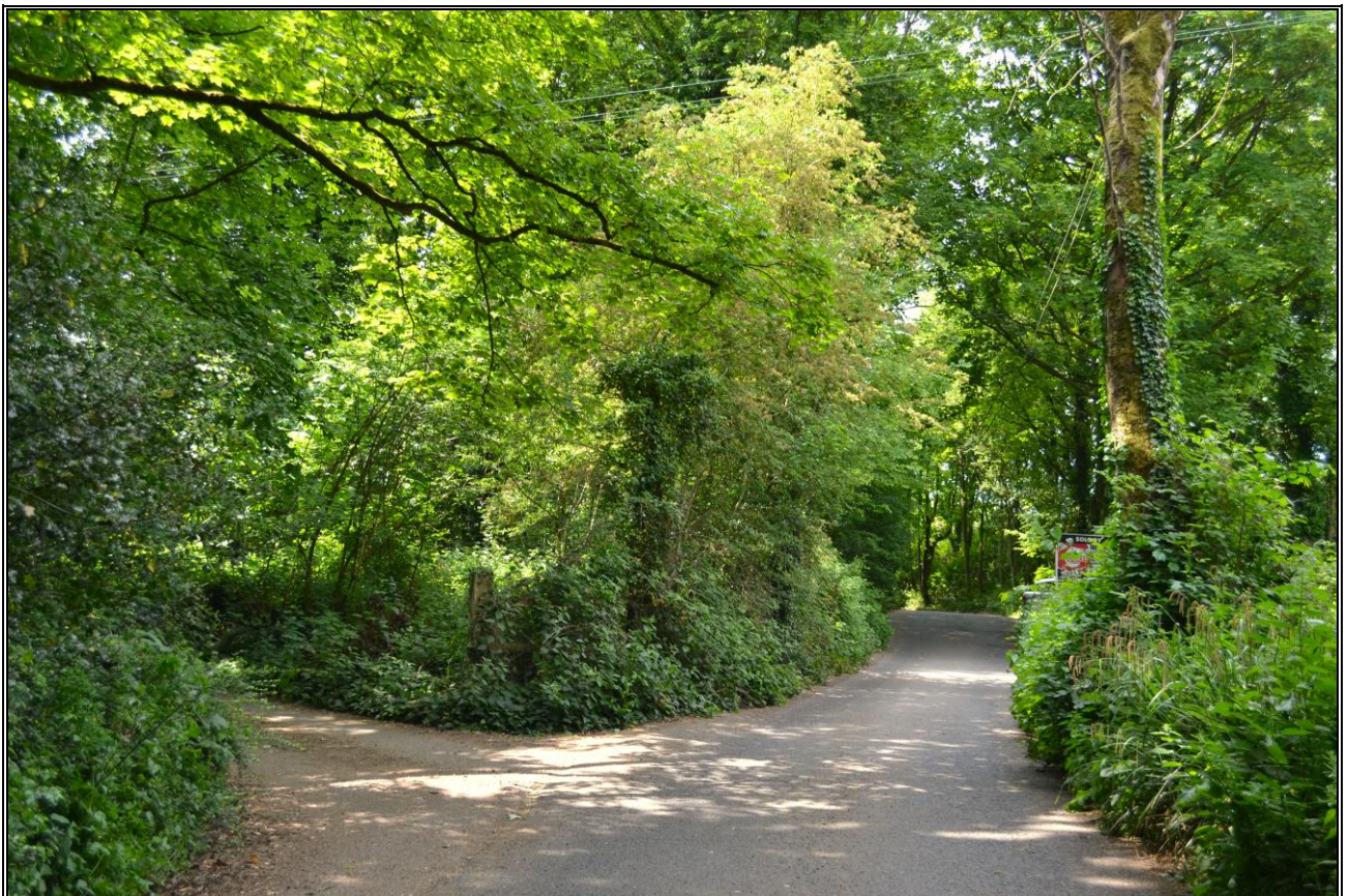
Building Plot B at Hill Park, Hill Top Lane, Whittle-le-Woods, Chorley, PR6 7QS